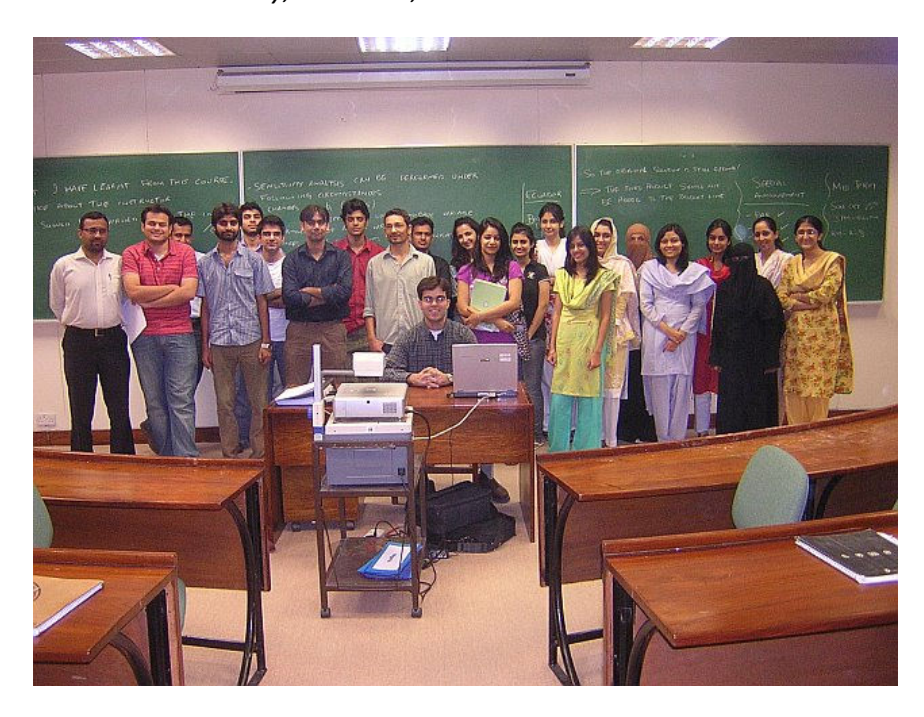
Figure 2: Snapshot of the on-campus class at LUMS

While at LUMS, the author also taught an on-campus 'Operations Optimization' course to the local students. Figure 2 shows a snapshot of the on-campus class at LUMS. In author's experience, one of the best ways to learn is by experiencing or doing it. The author encourages students to actively participate and present material in class. The student learning increases significantly if they have to research material and present it in class in front of their peers.