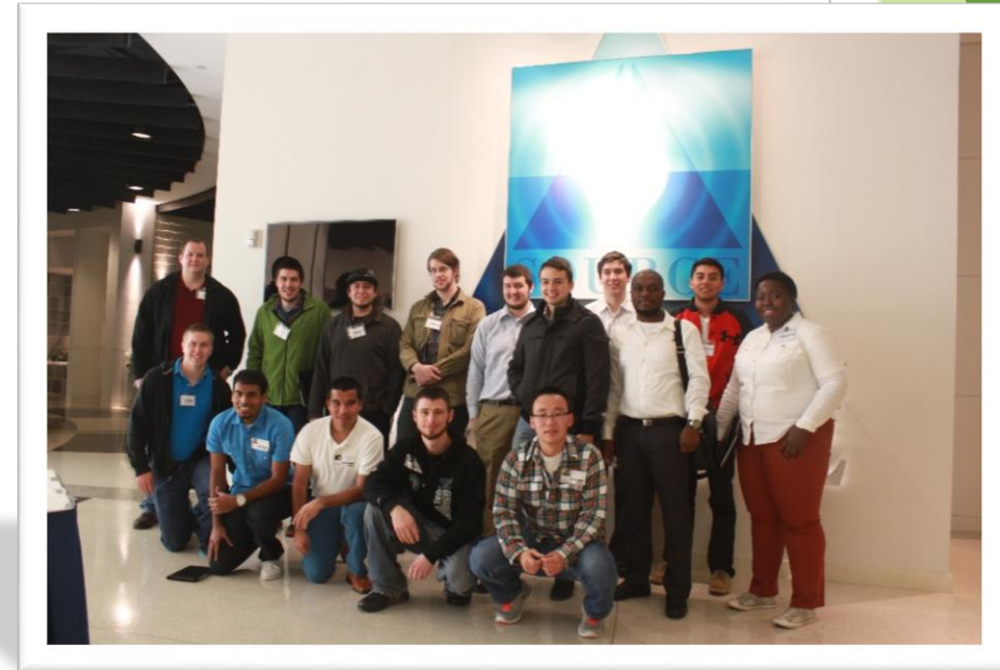
Engineering Technology students at the SOURCE training center