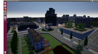
Figure 1. Default Map with no vehicles loaded when running CarlaUE4.sh

Once launched, CARLA will open the map specified, or the default. Once the world has been loaded, the simulation is ready for Python programs to communicate.