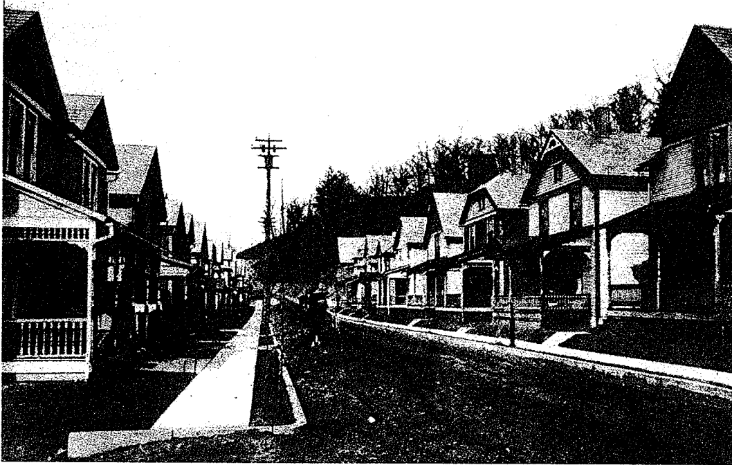
Figure 4-10 Streetcar Suburb, Pittsburgh, Pennsylvania, ca. 1910. Well-built frame homes, narrow lots, up-to-date urban amenities, and a pedestrian-oriented layout near a car line characterized "streetcar suburbs" across the United States. Blocks such as this one near Pittsburgh reflected suburbanization by an expanding middle class.